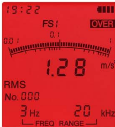
Overload indication screen