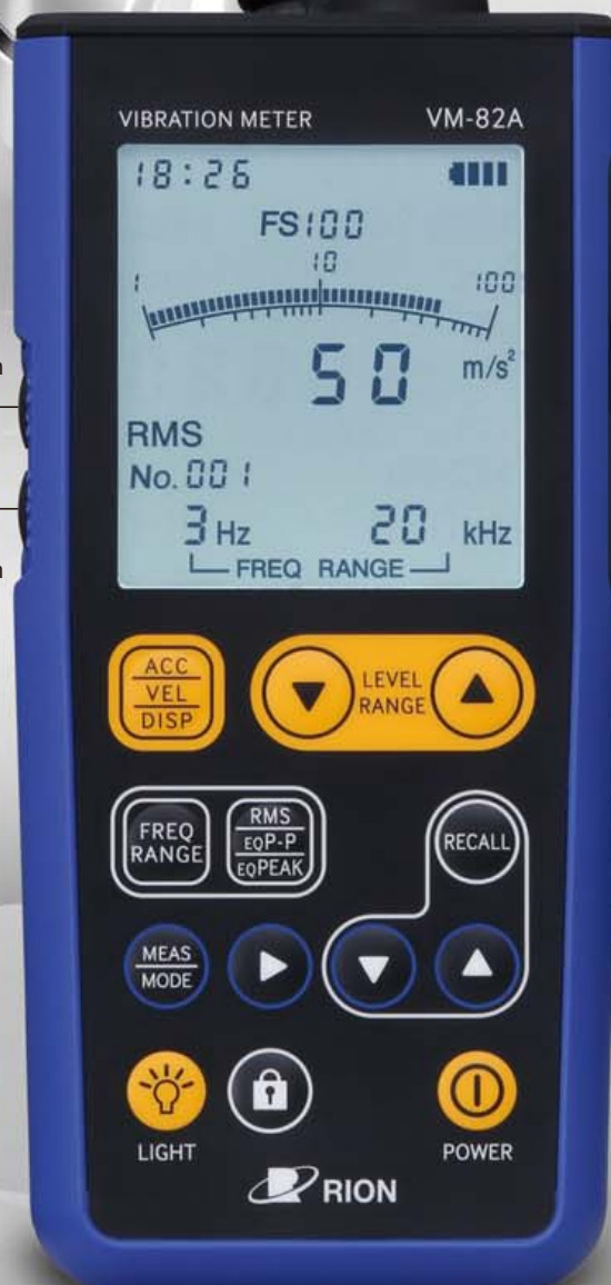
Right side panel