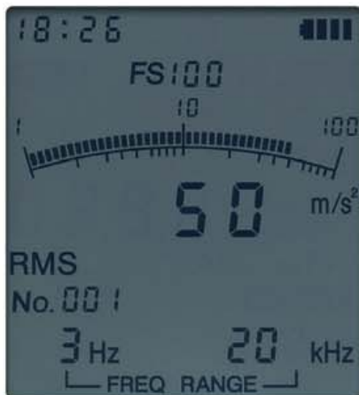
Measurement data display screen

The large LCD panel displays the bar graph meter and numeric reading at the same time, making it easy to visually evaluate any changes immediately. The display also shows the frequency range setting and other useful information. Backlighting can be turned on if required, allowing use of the unit also in dark locations. In case of overload, the indication "OVER" appears, and the entire display color changes to red.